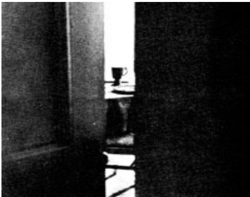
"Knock and the door will be opened."